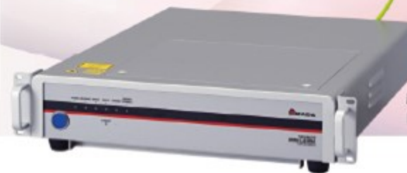
MM-L400A and External light receiving unit