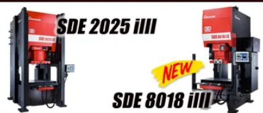
SDE 2025 iiiii