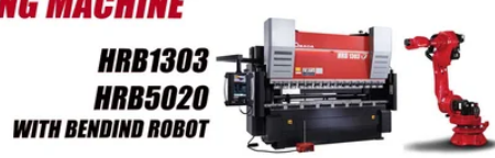
HRB1303 HRB5020 WITH BENDIN ROBOT