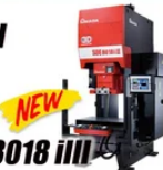
SDE 8018 iiiii