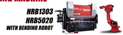
HRB1303 HRB5020 WITH BENDING ROBOT