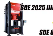
SDE 2025 iiiii